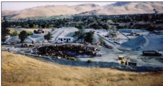
SEVEN UNITS RESPONDED to quarry fire which threatened the dry, grassy hills.